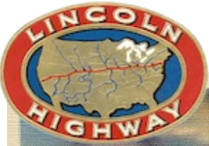
THE SUN RISES ON THE SEVEN MILE STRETCH OF THE LINCOLN HIGHWAY